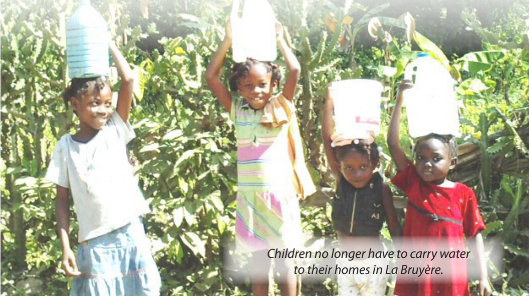
Children no longer have to carry water to their homes in La Bruyère.

"It's really a miracle to have been able to provide clean water, latrines and education," he said. "As I returned [to Ecuador] I was especially glad to see the community working in unity and so open to hearing the Word of God."