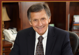
Reach Beyond President